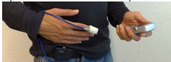
Fig. 1 User with heartbeat sensor on the finger, the step counter on the belt and the mobile phone.

To monitor the heartbeat rate we used the Alive Pulse Oximeter sensor from Alivetec which reads oxygen saturation and heartbeat rate data from a sensor, and transmits the data via Bluetooth. The sensor can be attached to the finger, hand, or foot. To compare heartbeat with the number of step per each activity we also used a normal pedometer. A java application was developed and run on a mobile phone which reads the HR data from the sensor via Bluetooth connection and saves it to a file. Additionally the application asks the user after a constant time period to enter the number of steps s/he took via the mobile phone's keypad by reading from the pedometer's display. All data is recorded on the mobile phone and later are used for analysis.