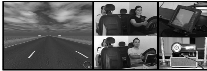
Figure 2: LCT screenshot (left), Driver with no video system (middle-top), Driver using video system (middle-bottom), Monitor display (right-top), Rear-seat webcam (right-bottom)