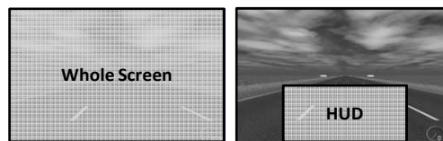
Figure 4: Areas of interests (AOIs) used in analyzing Tobii gaze data

Using Tobii Studio, gaze data was measured for all drives (except the reference drives) based on two areas of interests (AOIs)—Whole Screen and HUD Area (see Fig. 4). The HUD Area was at the bottom-center of the screen, covering about 24% of the total screen. This corresponds to the same area used by the gaze interaction algorithm in the HUD system to determine when to increase/decrease the opacity of the video. The Whole Screen was a covered the entire screen. Values for # fixations and total fixation length were determined for each AOI and divided by total duration of the driving segment for comparison purposes.